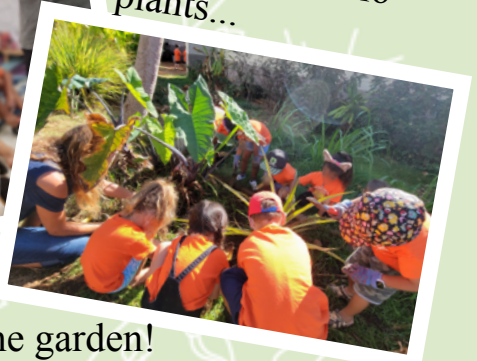
Learning outside in the garden!